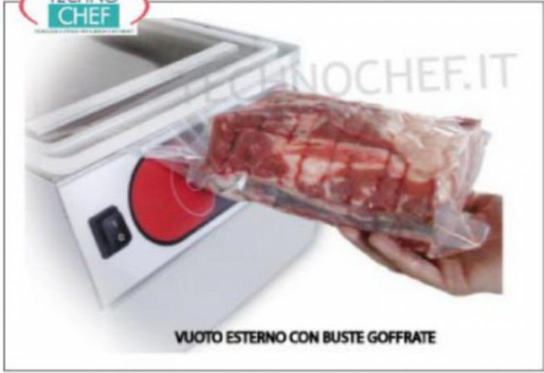
VUOTO ESTERNO CON BUSTE GOFFRATE