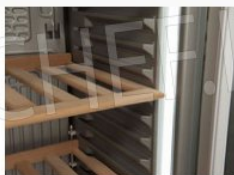
Ripiani regolabili in legno