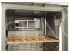
Ventilatore interno di assistenza