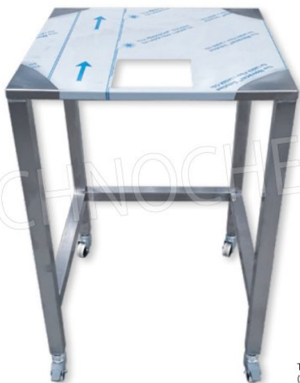
Tavolo di supporto su ruote (Optional)