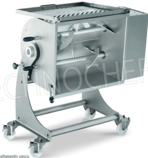
Ribaltamento vasca Tank overturn