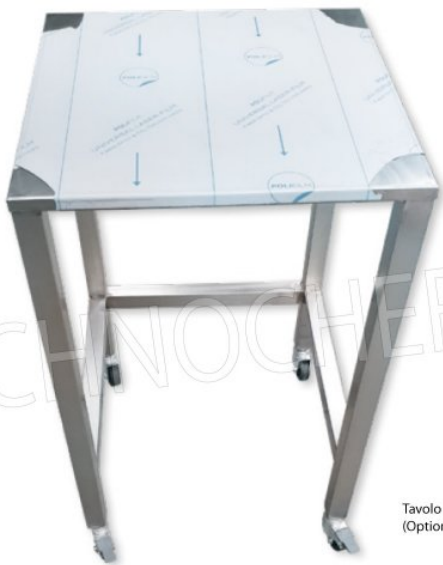
Tavolo di supporto su ruote (Optional)