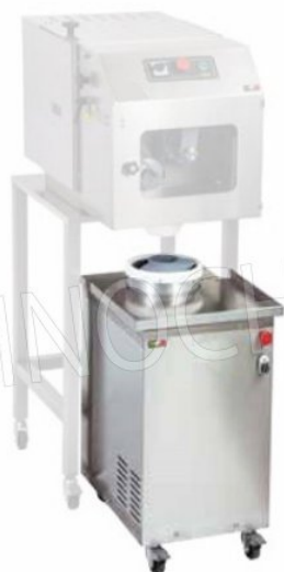
Esempio di sovrapposizione Porzionatrice - Arrotondatrice Example of overlapping Portioning - Rounding Machine