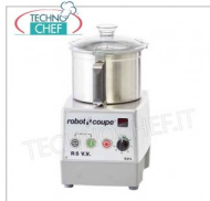
Table CUTTER R5 VV, tank capacity lt.5,9, ROBOT COUPE brand, professional

Table CUTTER R5 VV, ROBOT COUPE brand, with removable STAINLESS STEEL BOWL of 5.9 liters, Variable speed 300 / 3,500 rpm, V. 230/1, Kw 1,50, Weight 22 Kg, dimensions 280x350x490h mm