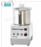
Table CUTTER R7 VV, tank capacity lt.7.5, ROBOT COUPE brand, professional

Table CUTTER R7 VV, ROBOT COUPE brand, with 7.5 liter removable STAINLESS STEEL BOWL, Variable speed from 300 to 3500 rpm, V. 230/1, Kw 1,5, Weight 23 Kg, dimensions 280x350x520h mm