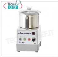
Table CUTTER R5 VV, tank capacity lt.5,9, ROBOT COUPE brand, professional

Table CUTTER R5 VV, ROBOT COUPE brand, with removable STAINLESS STEEL BOWL of 5.9 liters, Variable speed 300 / 3,500 rpm, V. 230/1, Kw 1,50, Weight 22 Kg, dimensions 280x350x490h mm