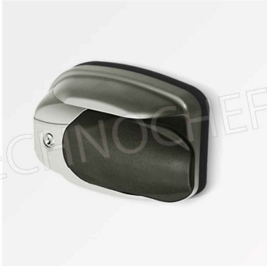
MANIGLIA STANDARD CON SERRATURA, CHIAVE A SBLOCCO INTERNO DI SICUREZZA