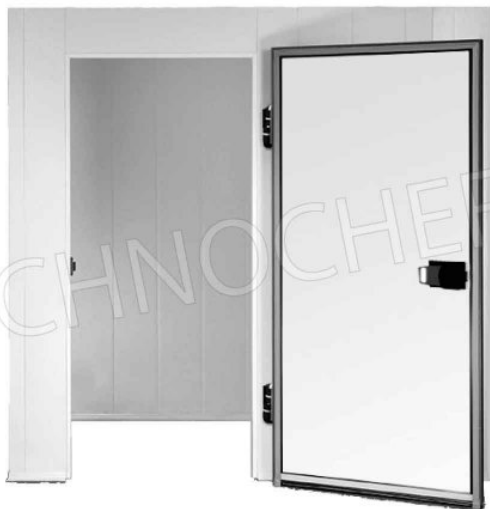
SU RICHIESTA: CELLA SENZA PAVIMENTO