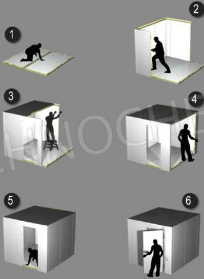
SEQUENZA DI MONTAGGIO PANNELLI