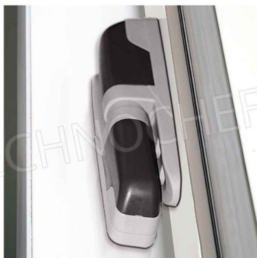
CERNIERE FACILMENTE REGOLABILI IN UTENZA IN 3 DIREZIONI