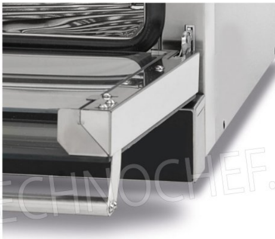
Disponibile con porta a ribalta