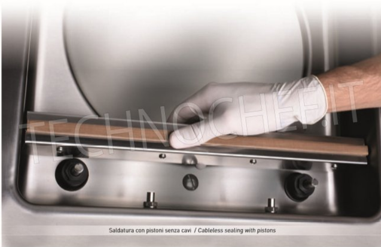
Saldatura con pistoni senza cavi / Cableless sealing with pistons