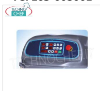
DIGITAL CONTROL PANEL Digital control panel