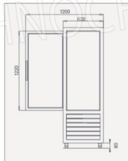
VISTA LATERALE Side view / Seitenansicht / Vue latérale