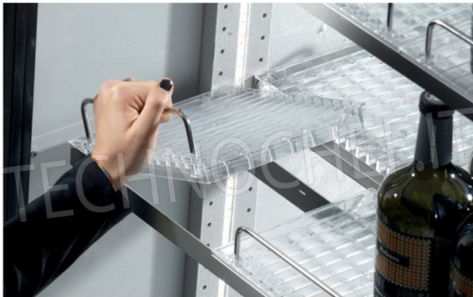
Ripiani facilmente estraibili per una completa pulizia (anche in lavastoviglie)