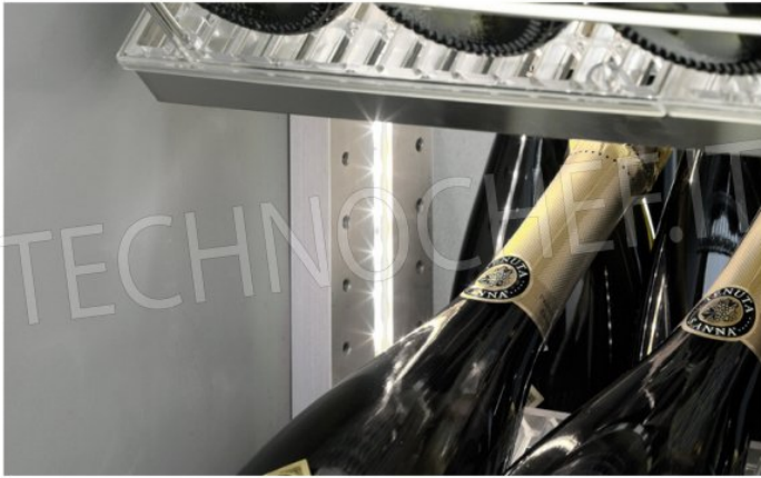
Illuminazione a LED integrata con colore naturale e Ambra (optional)