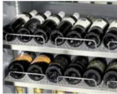
I ripiani in policarbonato e acciaio inox sono posizionabili a diverse altezze e reclinabili, è sufficiente spostare le viti con cui sono fissate alla barra centrale.