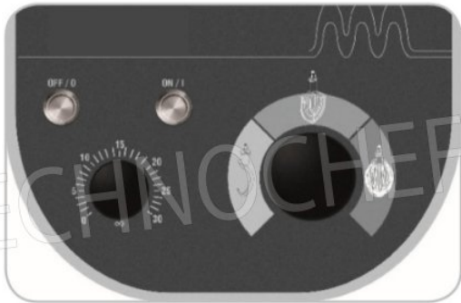
Comandi inox IP 67 Stainless steel IP 67 protected controls