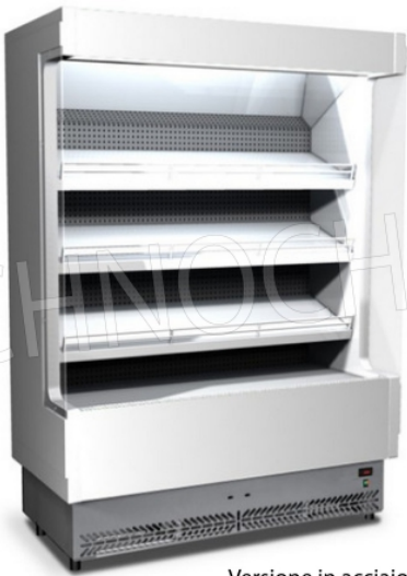
Versione in acciaio inox