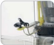
Tappo salvagoccia Drip cap