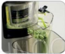
Vaschetta per gli scarti Tray for waste