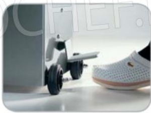
Ritorno pistone automatico