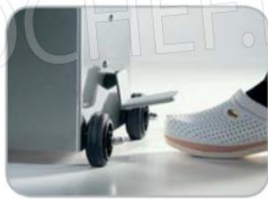
Ritorno pistone automatico