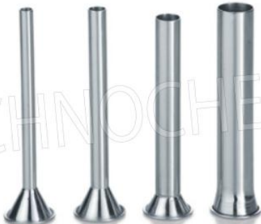
Imbuti inox (ø 13-16-20-25-28-38) opzionali