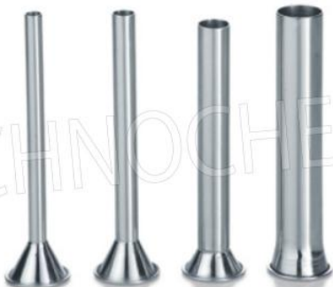
Imbuti inox (ø 13-16-20-25-28-38) opzionali