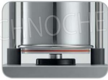
Guarnizione ermetica su cilindro oleodinamico