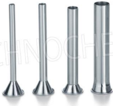
Imbuti inox (ø 13-16-20-25-28-38) opzionali