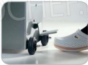
Ritorno pistone automatico