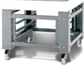
Supporto aperto per forno