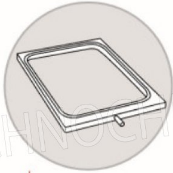
STAMPO MV mm 195X260 MOULD MV mm 195X260