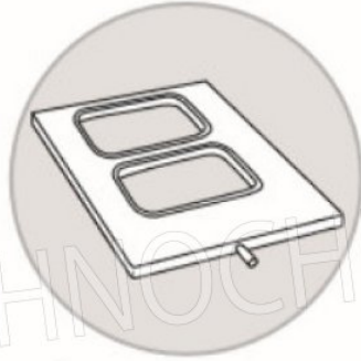
STAMPO MV mm 138x96 MOULD MV mm 138x96