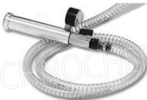
TUBO CON MANICOTTO ADATTATORE PER VUOTO IN CONT. GASTRO