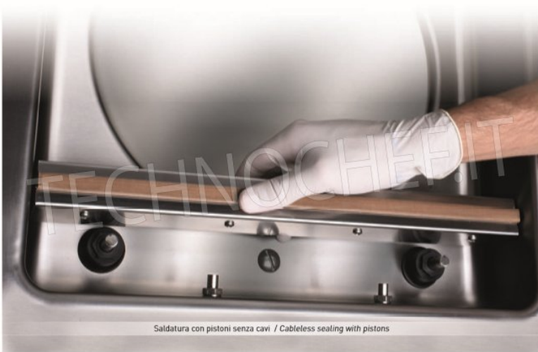
Saldatura con pistoni senza cavi / Cableless sealing with pistons