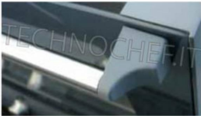
Colonnine porta in tecnopolimeri